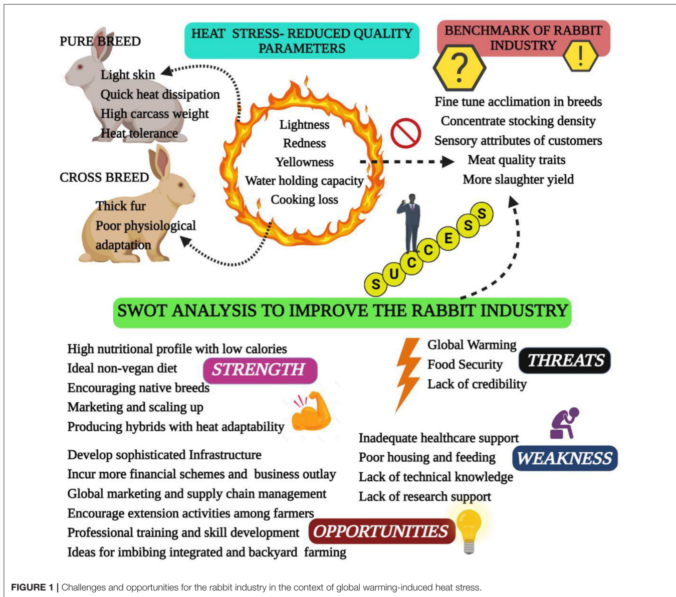
FIGURE 1 | Challenges and opportunities for the rabbit industry in the context of global warming-induced heat stress.

exposed to heat stress (30). The changes of these enzymes show significant liver damage and inflammation by heat stress in rabbits. In addition, heat stress causes alterations in minerals of rabbit plasma. Due to the increased ACTH by endocrine regulation, it promotes the glomeruli to retain sodium and excrete potassium so that the blood potassium level is reduced to maintain body fluid balance. Retaining sodium (Na) and removing potassium (K) increase the concentration of Na + and decrease the concentration of K + in serum, besides the concentration of copper ion (Cu 2+ ) in plasma is decreased, while Zn 2+ is increased during heat stress (14).